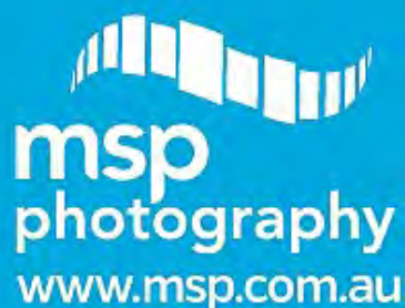
PHOTO DAY IS COMING ....