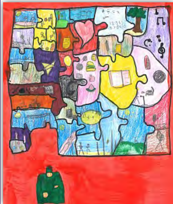
Imogen Belcher, 34D